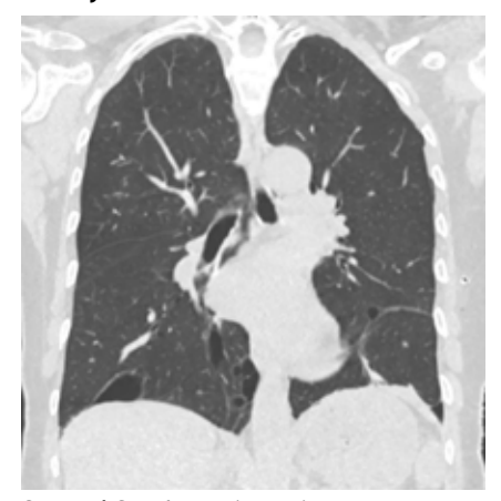
Coronal CT of a patient with BHD syndrome who had undergone a left-sided pleurectomy.<sup>7</sup>

If someone presents with recurrent or a family history of pneumothoraces, always consider BHD.<sup>5</sup>